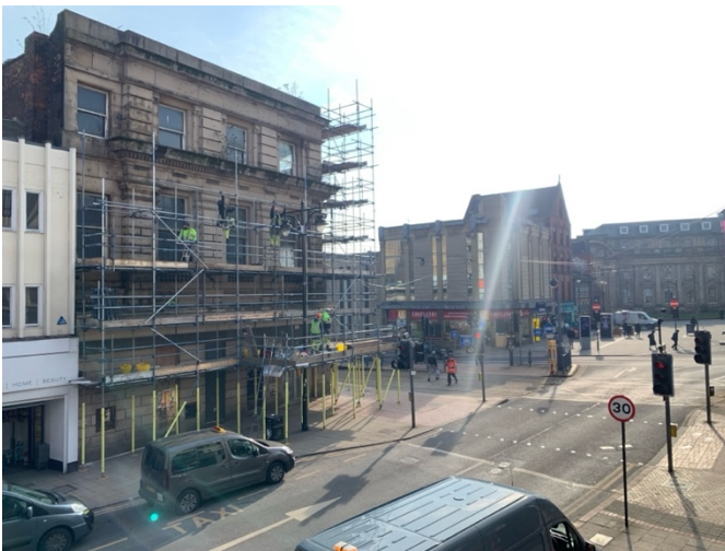
View of work commencing on site overlooking Fitzalan Square.